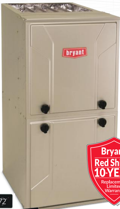
Model 987M Only 3

10-year parts and lifetime heat exchanger limited warranty when registered on time. 3 In addition, Model 987M offers the Red Shield™ 10-year unit replacement limited warranty (heat exchanger failure only) upon timely registration. 3