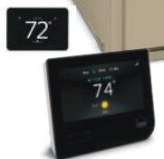
Control and Smart Sensor sold separately