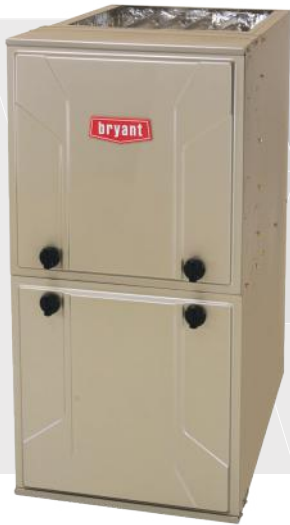
Model 987M and 986T