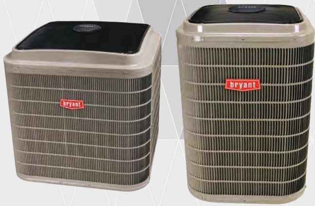
Models 186C, 189B, 180B, 187B, 186B