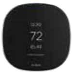
ecobee THERMOSTAT Powered by Bryant

Achieve greater efficiency and whole-home comfort with this Wi-Fi® smart thermostat.