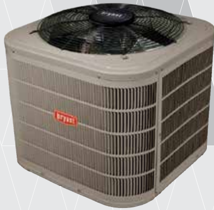
Models 226A, 225B, 226C