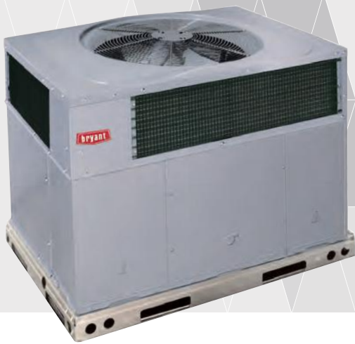
Models 707C & 577C