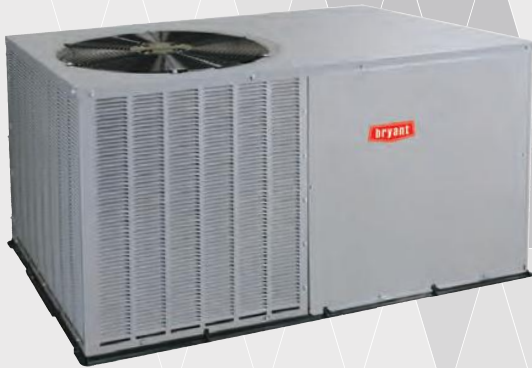
Models PA4Z & PH4Z